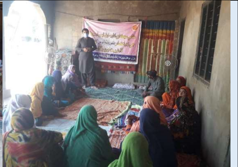
COVID_19 Session at Community Level District Kashmir @ Kandhkot