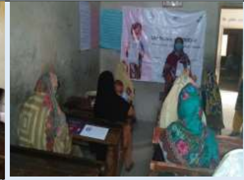
Community Sessions at Shikarpur