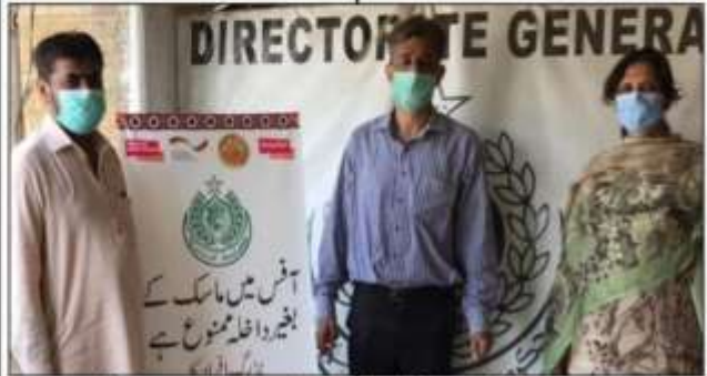
ڪراچي: ڪوويڊ 19 تي جاڳرتا مواد جي ورهاست واري تقريبن جو ڏيک

دادو (ڊر) انجمن قلندري پاڪستان دادو پاران سنڌ و ڏسو صفحو 3 بقايا نمبر 4