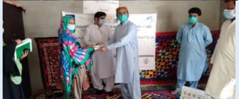
PPEs Distribution under PINs at Qubo Saeed Khan District Kamber-Shahdadkot