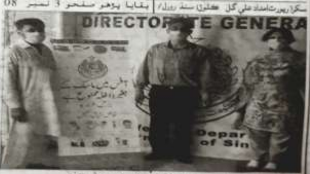
ڪراچي: ڪوويڊ 19 تي جاڳرتا مواد جي ورهاست واري تقريبن جو ڏيک

ڪورونا بابت تيار ڪيل جاڳرتا مواد بئرن، پمفلٽ ۽ اسٽيڊيز جي ورهاست ڪئي وئي جاڳرتا مواد جي ورهاست جو مقصد ڪورونا بابت عوامي جاڳرتا وڌائڻ آهي. اڳواڻ