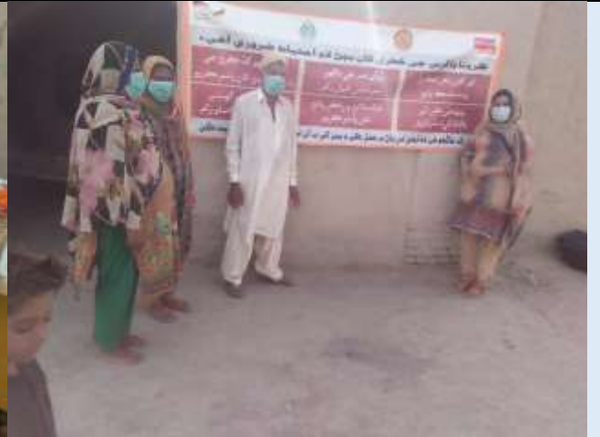
Under HelpAge Project IEC material displayed at District Shikarpur