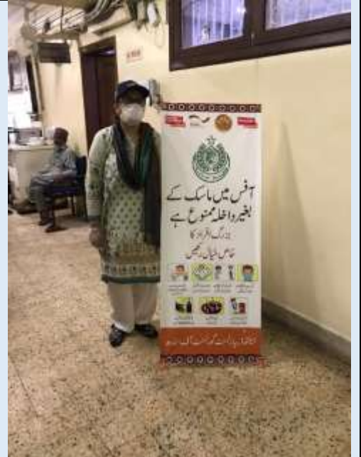
IEC Material displayed at Govt. Office at Karachi under HelpAge Project