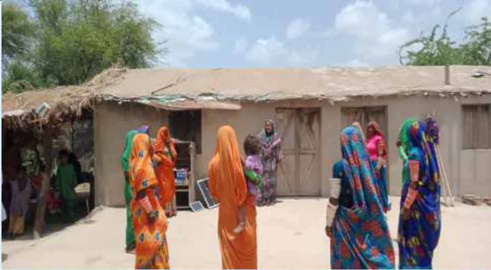
Social-Distancing Session at District Mirpurkhas