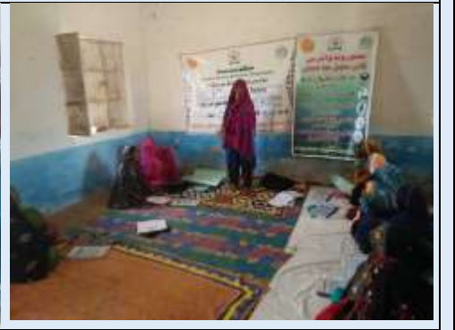
COVID-19 Awareness sessions at District Mirpurkhas